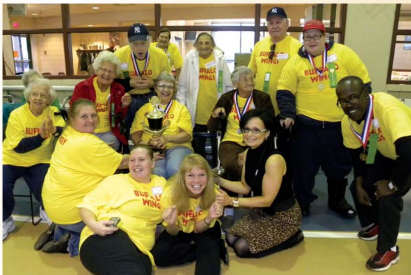
Team Buffalo celebrates their win in the DePaul Senior Olympics and proudly shows off the DePaul Cup.