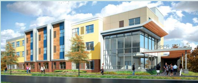
Upper Falls Square Apartments Rochester, NY

Applications for new tenants at the Joseph L. Allen Apartments have begun being accepted with an October opening planned. A spring 2018 opening is estimated for Packet Boat Landing. Construction on the Upper Falls Square Apartments is expected to be complete in the fall of 2018.