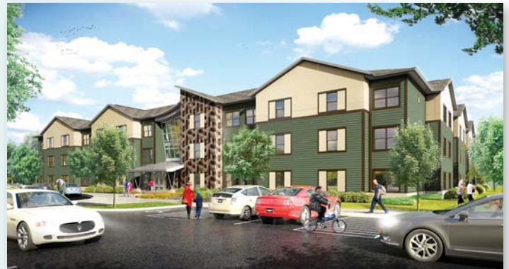
Packet Boat Landing Apartments Lockport, NY