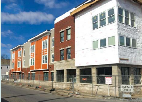
Joseph L. Allen Apartments Schenectady, NY

DePaul is preparing for an October opening for the Joseph L. Allen Apartments, a new three-story, 52,500 square foot community which will feature 51 studio, one- and two-bedroom mid-market apartments in Schenectady. In addition, DePaul has broken ground on the Upper Falls Square Apartments, two multi-story buildings with 150 studio, one- and two-bedroom apartments which will provide affordable and supportive housing in Rochester. Construction continues on Packet Boat Landing in Lockport featuring 60 one-bedroom mid-market apartments.