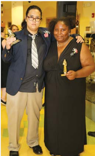
King and Queen