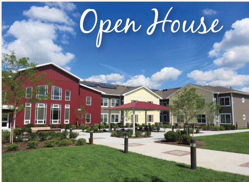
An exterior view of DePaul's Trolley Station Apartments, a 48-unit community in Canandaigua, New York serving income-eligible tenants and offering on-site supports to accommodate tenants with mental health needs.

The affordable housing project also received $6.5 million in tax-exempt bond financing from the New York State Housing Finance