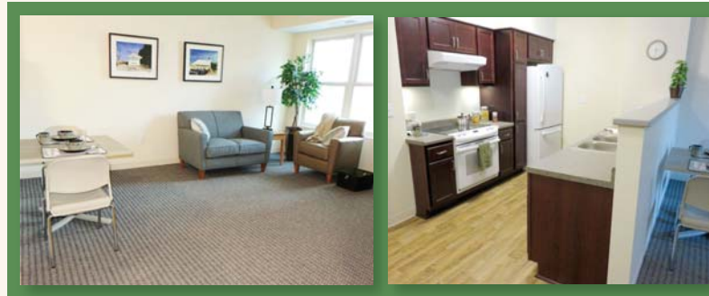
A glimpse inside DePaul's Trolley Station Apartments, a 48-unit community in Canandaigua, New York serving income-eligible tenants and offering on-site supports to accommodate tenants with mental health needs.

Agency, with an additional $3.25 million Medicaid Redesign Team subsidy, a $152,200 incentive from NYSEDA for compliance of standards with the Energy Star Certified Homes Program, and a $4.2 million equity investment from First Sterling Financial, Inc.