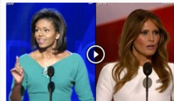
See Melania Trump, Michelle Obama speeches side-by-side 1:19