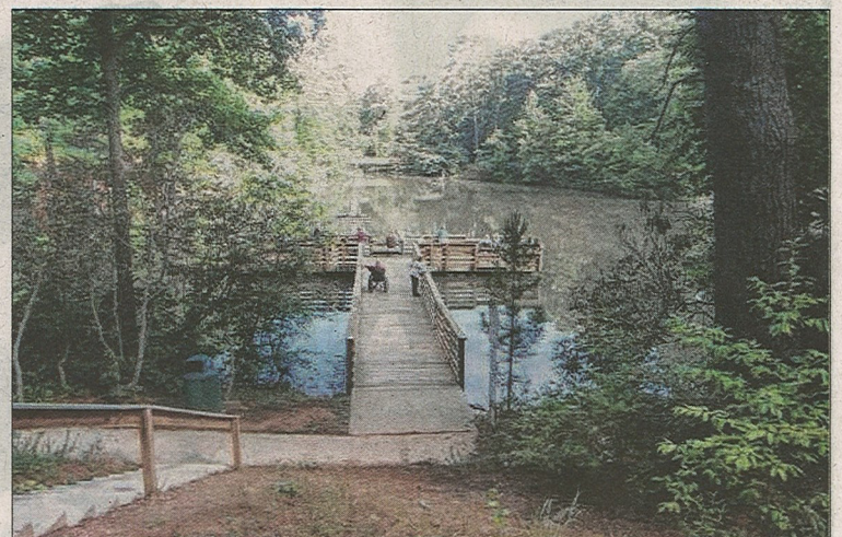
A view of the pier where several Twelve Oaks residents spent some time fishing recently on an outing to Westwood Park.