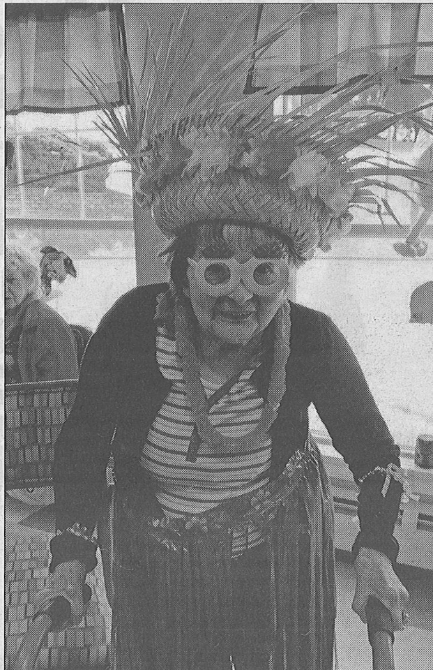
Drinks with umbrellas, steel drum music, homemade flower leis, sunny skies and warm temperatures set the perfect scene for a summer Luau at Woodcrest Commons. Pictured here enjoying the festivities. SUBMITTED

Send your photos, along with caption and contact information, to JBattaglia@messengerpostmedia.com