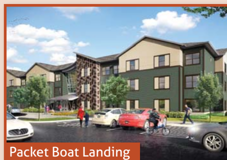
Packet Boat Landing

Both locations will also feature artwork that pays homage to the history of the region.