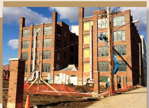
Carriage Factory Apartments