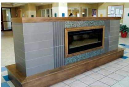
Kensington Square fireplace