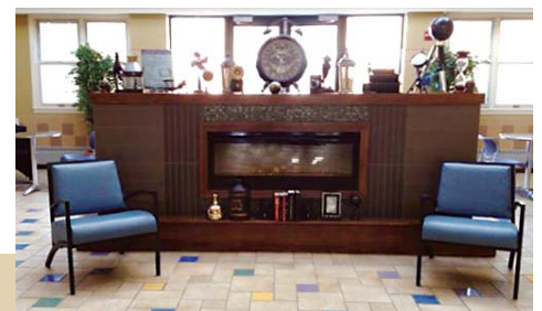
Seneca Square fireplace