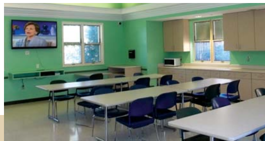
Kensington Square activities room