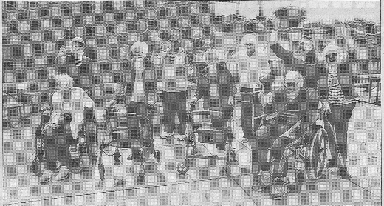
Westwood Commons sponsors a safari trip for residents at Hidden Valley Animal Adventure.