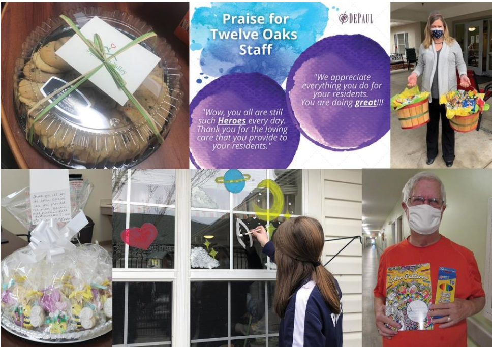
The outpouring of donations of support from families and community members in recent months has truly been overwhelming. From the food and cards to socially-distanced acts of service, donations of personal protective equipment, and much more, we are beyond grateful.