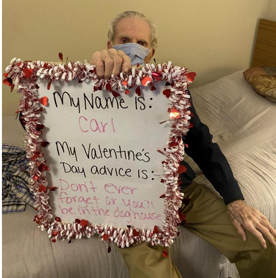
The men at Cambridge House in Hildebran, North Carolina have a good sense of humor when it comes to love advice.