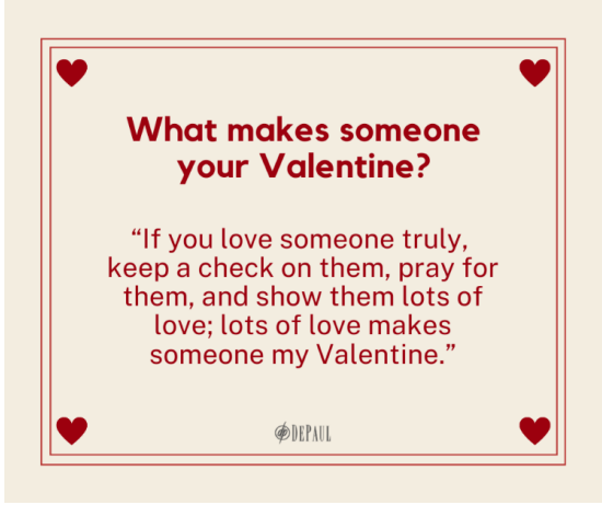
Seniors at Rolling Ridge in Newton Grove, North Carolina expressed their sentiments about all things love for Valentine's Day.