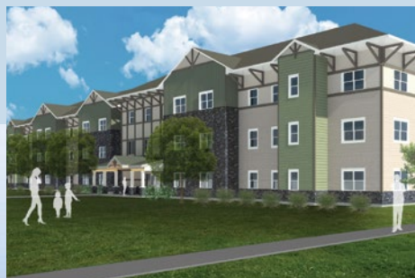
Port Byron Apartments (right) Holland Circle Apartments (below)