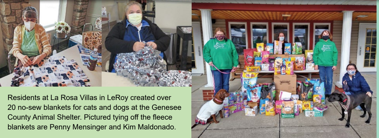
Heritage Manor of Lockport raised $455 and donated a variety of dog and cat food to Diamonds in the Ruff Animal Rescue with community support. The senior community also recently hosted a food drive with donations going to the Resource Council of WNY. Inc.