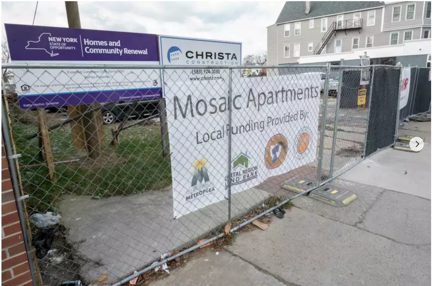
Signs are seen on a construction fence during a ground breaking celebration for the Mosaic Apartments at the Mont Pleasant Branch Library, which is near the future apartments in Schenectady, N.Y. on Wednesday, Nov. 29, 2023.