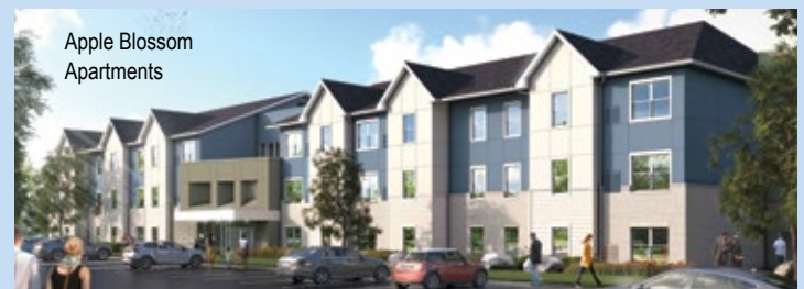
Apple Blossom Apartments

DePaul received funding for the Apple Blossom Apartments in Cheektowaga, New York in December 2018. The former Living Opportunities of DePaul administration building was demolished to make way for the new project which includes a total of 110 units for income-eligible tenants. The existing Apple Blossom apartment building will be renovated to include 15 additional one-bedroom units for a total of 30 units. New construction will include two new buildings each containing 40 units. Forty-eight units will be reserved for individuals with mental illness who will have access to on-site supportive services. The project will provide affordable housing options to the community's most vulnerable including seniors, individuals with a mental health diagnosis and individuals who are Deaf.