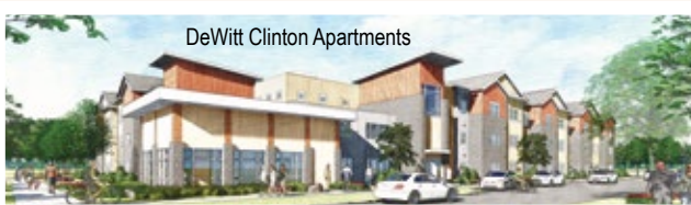
DeWitt Clinton Apartments

Construction began in October 2018 on the Knitting Mill Apartments in Perry, New York which will have a total of 48 units for income-eligible tenants. Thirty-four of the apartments are supportive ESSHI units. On-site housing specialist support services will be provided to tenants with histories of unstable housing in order to promote stability, health and independent living. Once home to the Champion Knitting Mill, the project will have both one- and two-bedroom units and is anticipated to open in fall 2019.