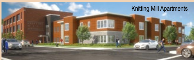
Knitting Mill Apartments

Construction began in October 2018 on the Knitting Mill Apartments in Perry, New York which will have a total of 48 units for income-eligible tenants. Thirty-four of the apartments are supportive ESSHI units. On-site housing specialist support services will be provided to tenants with histories of unstable housing in order to promote stability, health and independent living. Once home to the Champion Knitting Mill, the project will have both one- and two-bedroom units and is anticipated to open in fall 2019.