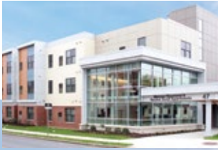
Upper Falls Square Apartments