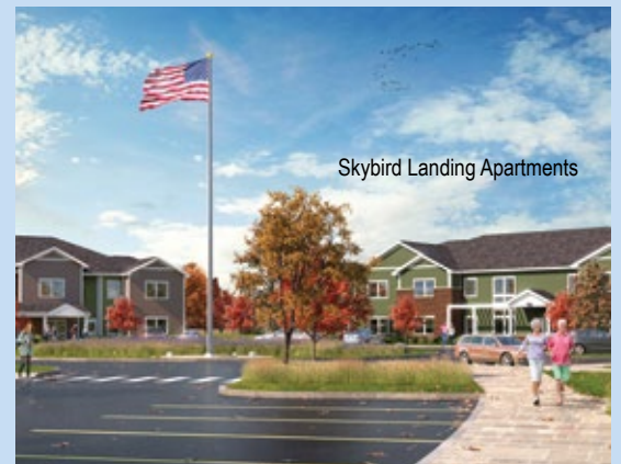
Skybird Landing Apartments

DePaul continued construction on the Skybird Landing Apartments in Geneseo, New York which will have a total of 60 units of housing for income-eligible tenants. The name of the project pays homage to Geneseo's National Warplane Museum, a warbird and military history museum founded in 1994. Thirty of the apartments are Empire State Supportive Housing Initiative (ESSHI) units and will provide on-site housing specialist support services that promote stability, health and independent living for persons with histories of unstable housing. DePaul broke ground on the project which features six buildings in December 2017 and anticipates completion in the spring of 2019.