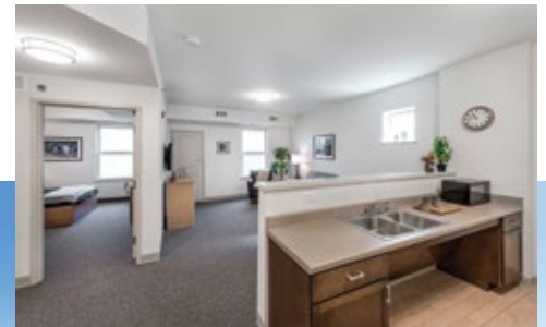
Packet Boat Landing Apartments

All apartments have fully equipped kitchens, a wall-mounted TV including basic cable service, and in-unit storage. Heat, air conditioning, hot water and electricity are included in the rent and community laundry facilities are available at no cost to the tenant. Tenants have access to a community room, lounges and a computer lab and free Wi-Fi in common areas. An open house was held in May 2018.