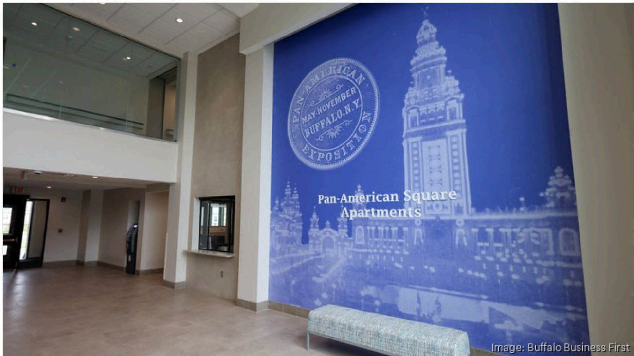
The lobby at the Pan-American Square Apartments in Buffalo